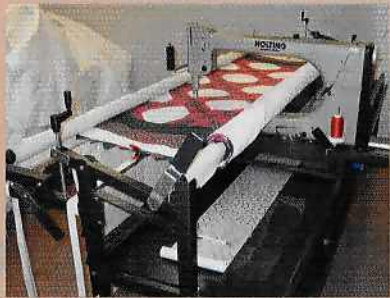
Use the laser stylus to follow pantograph patterns from this side of the hand guided Nolting