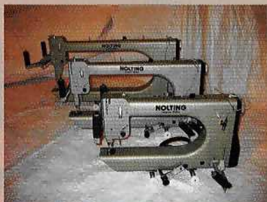
18", 24", and 30" machines with standard electronics or the Intellistitch options