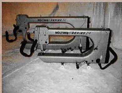
Special edition PRO Series available in 24" or 30".